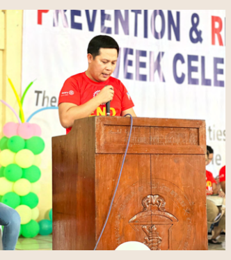
"Persons with Disabilities Accessibility and Right: Towards a Sustainable Future Where No One is Left Behind"

The club was invited and gave grocery packs and 1 bag of 5kg rice to each person with disability and their family. There were 200 beneficiaries in this event.