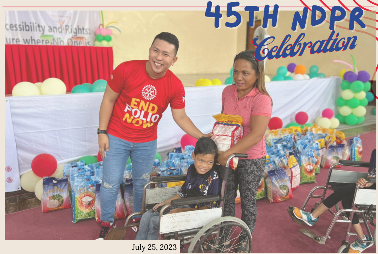
Sibagat, Agusan del Norte